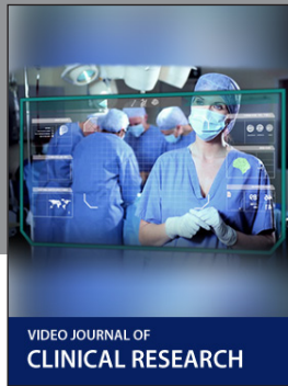
VIDEO JOURNAL OF CLINICAL RESEARCH