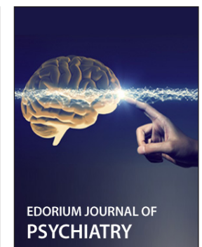
EDORIUM JOURNAL OF PSYCHIATRY