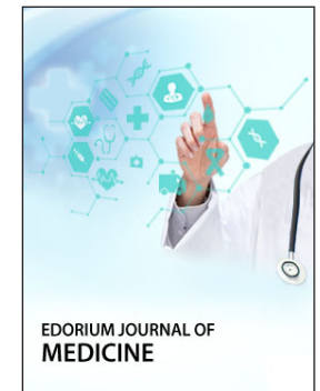
EDORIUM JOURNAL OF MEDICINE

Submit your manuscripts at www.edoriumjournals.com