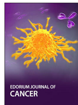
EDORIUM JOURNAL OF CANCER