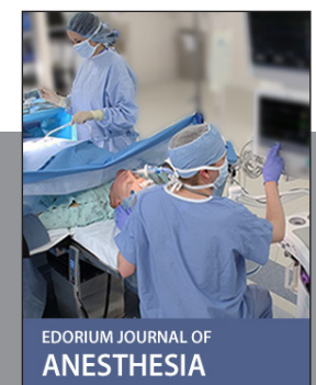
EDORIUM JOURNAL OF ANESTHESIA