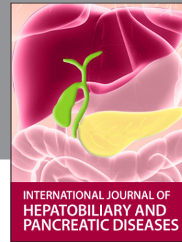
INTERNATIONAL JOURNAL OF HEPATOBIILIARY AND PANCREATIC DISEASES