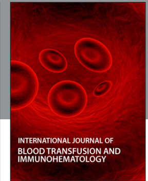
INTERNATIONAL JOURNAL OF BLOOD TRANSFUSION AND IMMUNOHEMATOLOGY