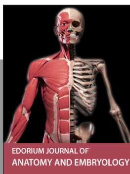
EDORIUM JOURNAL OF ANATOMY AND EMBRYOLOGY