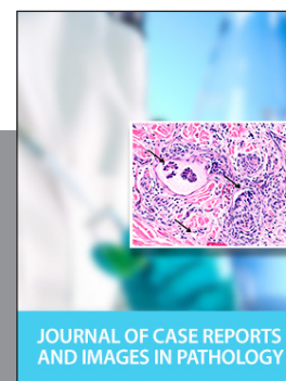
JOURNAL OF CASE REPORTS AND IMAGES IN PATHOLOGY