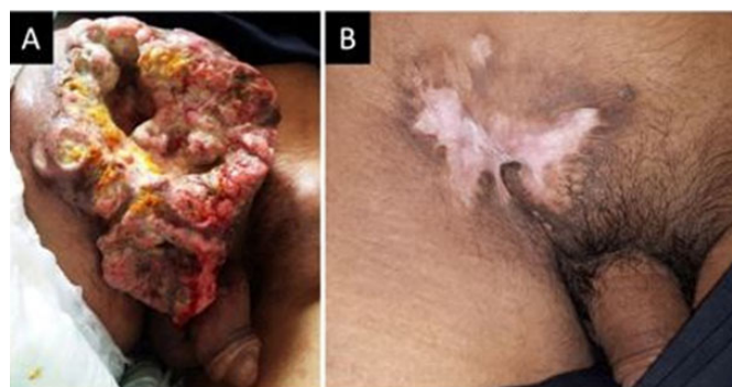
Figure 1: (A) Large inguinal mass, (B) Regression of the mass.

Cryptorchidism is the absence of one or both testes from the scrotum [1]. It is the most common birth defect of the male genitalia [2]. Lip et al. used meta-analysis to identify 12 series, they conclude that the relative risk