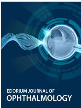
EDORIUM JOURNAL OF OPHTHALMOLOGY

Submit your manuscripts at www.edoriumjournals.com