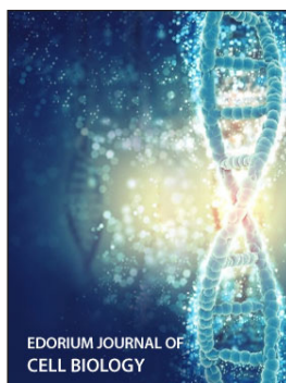
EDORIUM JOURNAL OF CELL BIOLOGY