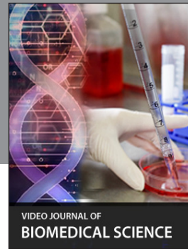
VIDEO JOURNAL OF BIOMEDICAL SCIENCE