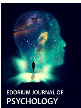
EDORIUM JOURNAL OF PSYCHOLOGY