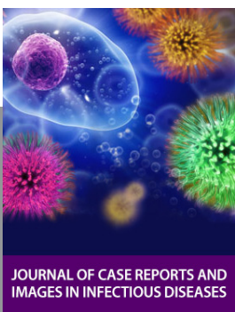
JOURNAL OF CASE REPORTS AND IMAGES IN INFECTIOUS DISEASES