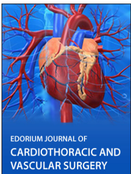
EDORIUM JOURNAL OF CARDIOTHORACIC AND VASCULAR SURGERY