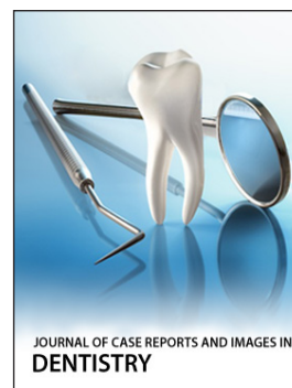
JOURNAL OF CASE REPORTS AND IMAGES IN DENTISTRY